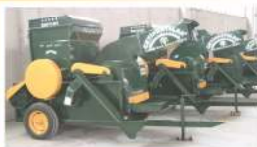
NCK-01 MAJ MULTI PURPOSE THRESHER SPIRAL TYPE